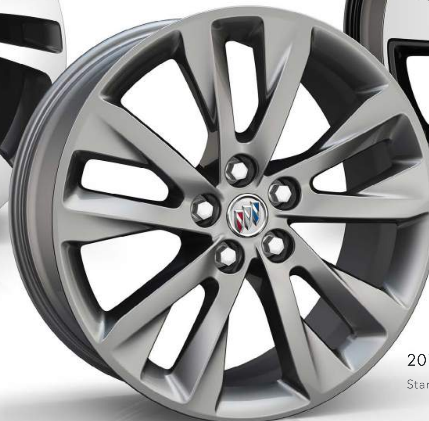
20" Aluminum With Pearl Nickel Finish Standard on Avenir.