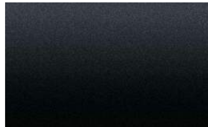
Ebony Twilight Metallic Additional charge; premium paint.

Due to current supply-chain shortages, certain features shown have limited or late availability, or are no longer available. See the window label or a dealer regarding the features on an individual vehicle. Exterior colors are subject to change. Visit buick.com for current availability.