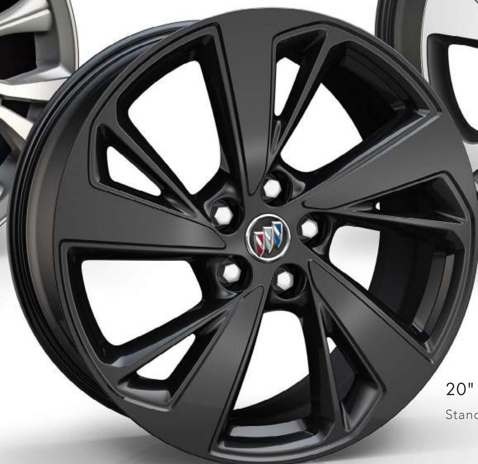
20" Aluminum With Dark Finish Standard with Sport Touring Package.