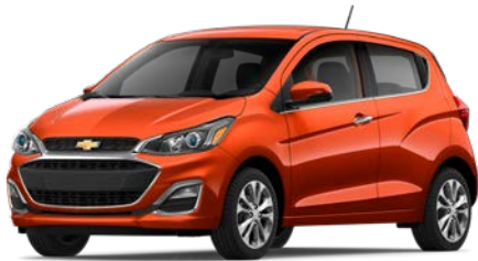
Cayenne Orange 1