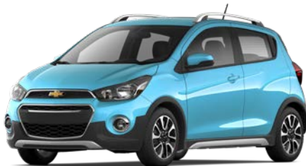
Mystic Blue 1