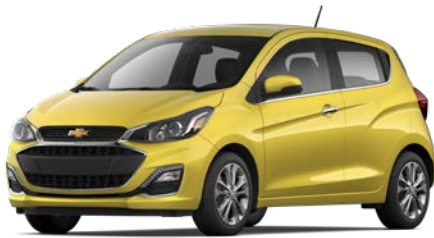
Nitro Yellow 1