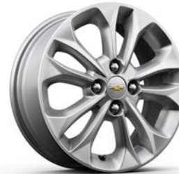
15" Silver-Painted Aluminum Wheels Standard on 2LT

1 Chevrolet Infotainment System functionality varies by model. Full functionality requires compatible Bluetooth and smartphone, and USB connectivity for some devices. 2 Safety or driver assistance features are no substitute for the driver's responsibility to operate the vehicle in a safe manner. Read the vehicle Owner's Manual for important feature limitations and information. 3 If you decide to continue service after your trial, your selected subscription plan will automatically renew thereafter. You will be charged at then-current rates. Fees and taxes apply. To cancel you must call SiriusXM at 1-866-635-2349. See SiriusXM Customer Agreement for complete terms at siriusxm.com . All fees and programming subject to change.