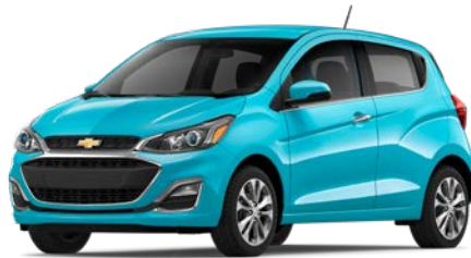
Mystic Blue 1