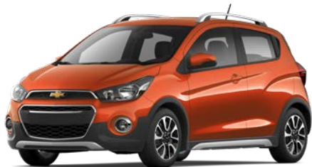
Cayenne Orange 1