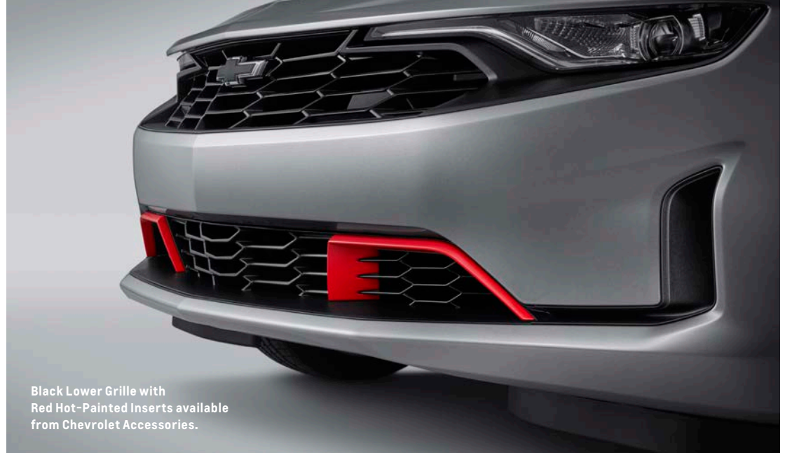
Black Lower Grille with Red Hot-Painted Inserts available from Chevrolet Accessories.