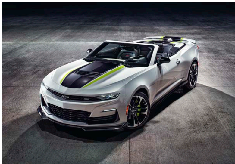
Shock and Steel Special Edition.

1 Coupe only. 2 Not available in California or Washington state. 3 Chevrolet Infotainment System functionality varies by model. Full functionality requires compatible Bluetooth and smartphone, and USB connectivity for some devices. 4 Functionality is subject to limitations and varies by vehicle, infotainment system and location. Select service plan required. Certain Alexa Skills require account linking to use. Visit onstar.com for additional details. 5 Third-party trademarks are the property of their respective third-party owners and used under agreement. Requires active service plan and paid AT&T vehicle data plan. Visit onstar.com for details and limitations. 6 If you decide to continue service after your trial, your selected subscription plan will automatically renew thereafter. You will be charged at then-current rates. Fees and taxes apply. To cancel you must call SiriusXM at 1-866-635-2349. See SiriusXM Customer Agreement for complete terms at siriusxm.com . All fees and programming subject to change. Certain features require a SiriusXM subscription and the Chevrolet Connected Access plan. See siriusxm.com and onstar.com for details and limitations. 7 Extra-cost color.