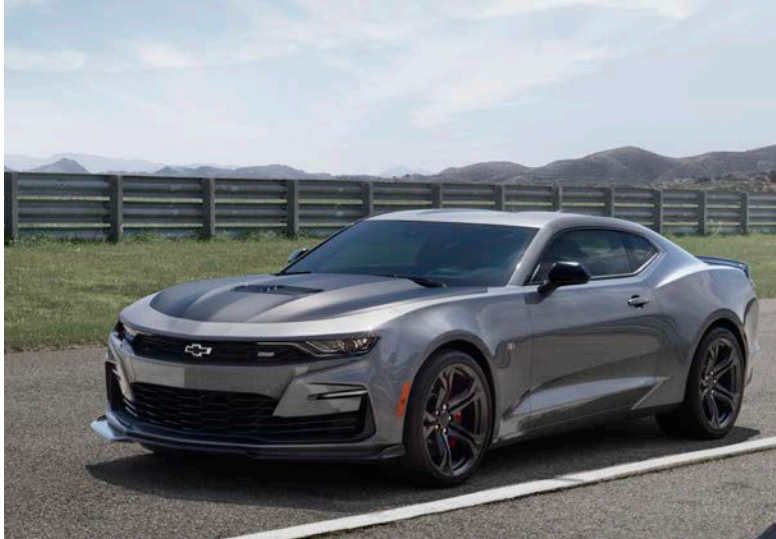
SS 1LE Track Performance Package.