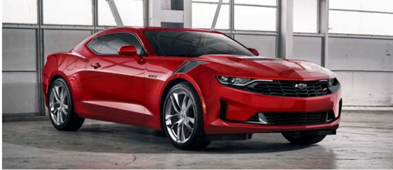
Design Package 1.