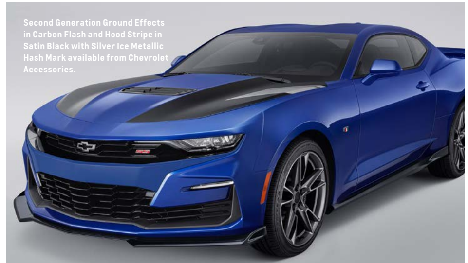
Second Generation Ground Effects in Carbon Flash and Hood Stripe in Satin Black with Silver Ice Metallic Hash Mark available from Chevrolet Accessories.