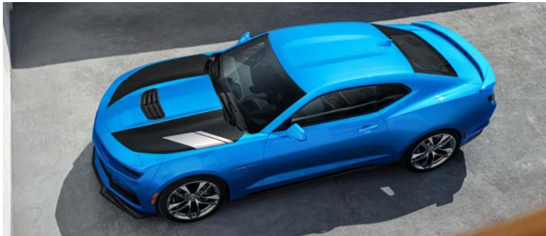
Design Package 3.