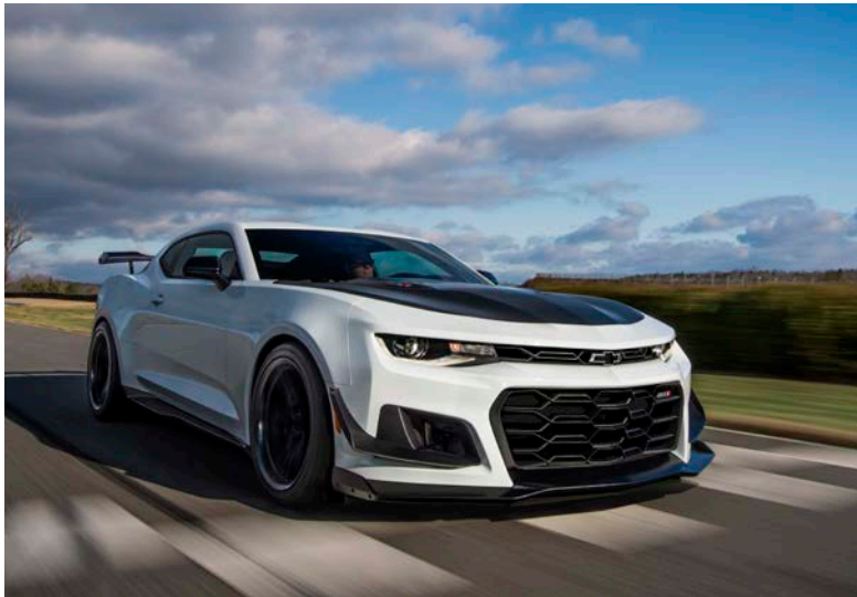
ZL1 1LE Extreme Track Performance Package.