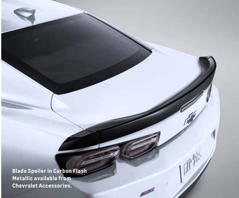
Blade Spoiler in Carbon Flash Metallic available from Chevrolet Accessories.