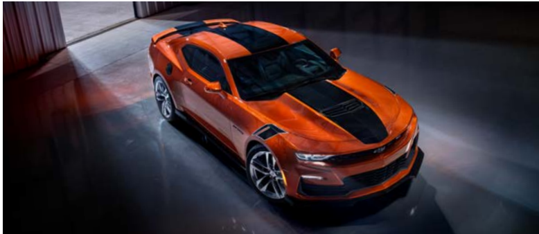
Design Package 2.