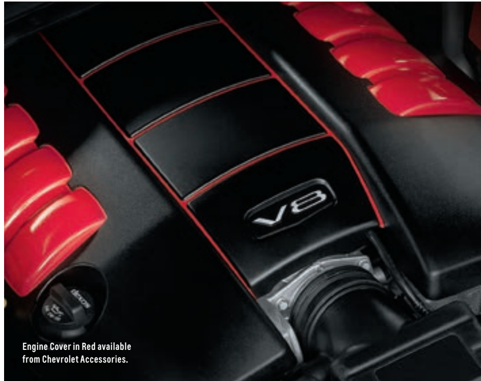
Engine Cover in Red available from Chevrolet Accessories.