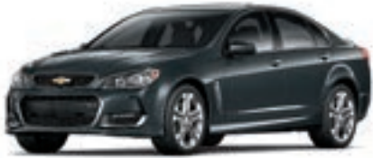
NIGHTFALL GRAY METALLIC