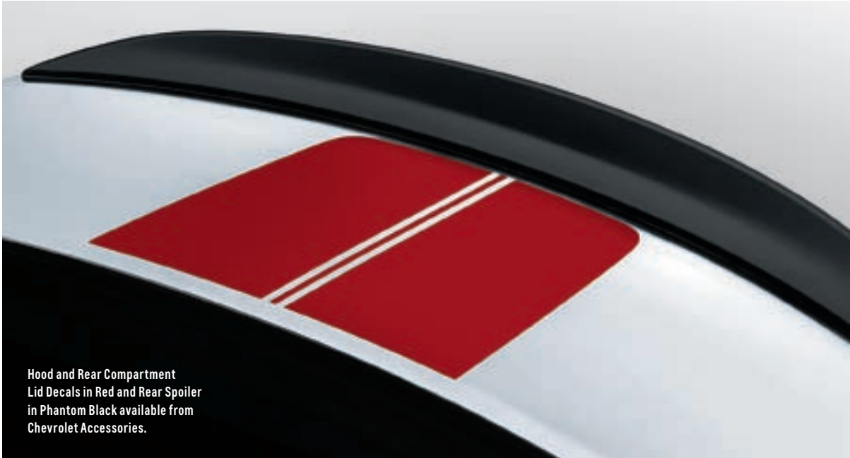
Hood and Rear Compartment Lid Decals in Red and Rear Spoiler in Phantom Black available from Chevrolet Accessories.