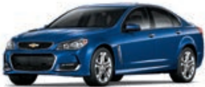
SLIPSTREAM BLUE METALLIC