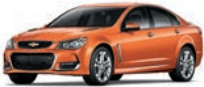
ORANGE BLAST METALLIC 1