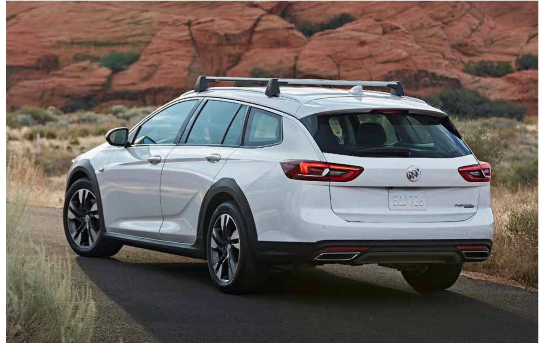
Regal TourX Essence shown in Summit White with available features and dealer-installed accessories.

1 Read the vehicle Owner's Manual for important feature limitations and information.