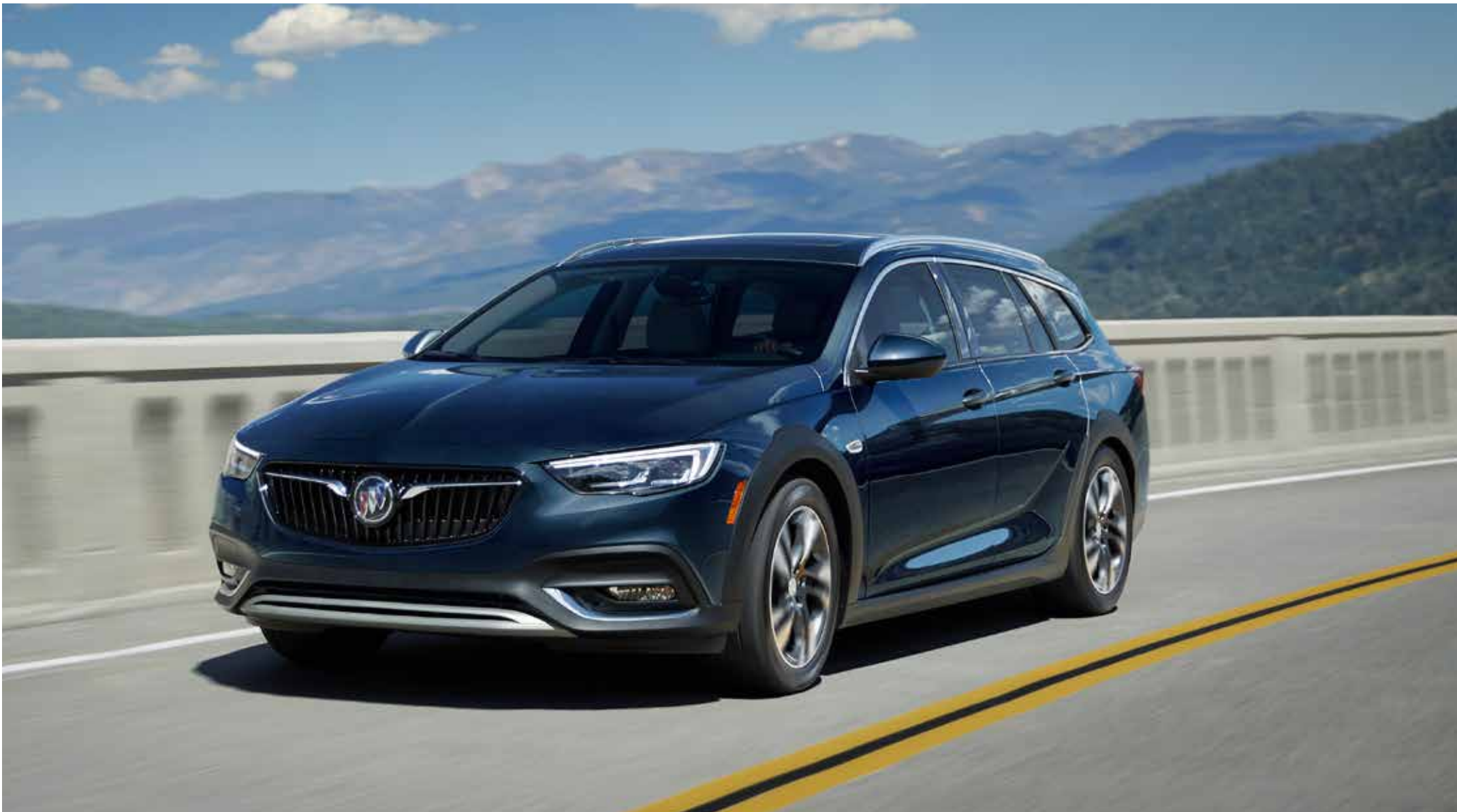
Regal TourX Essence shown in Dark Moon Blue Metallic with available features.