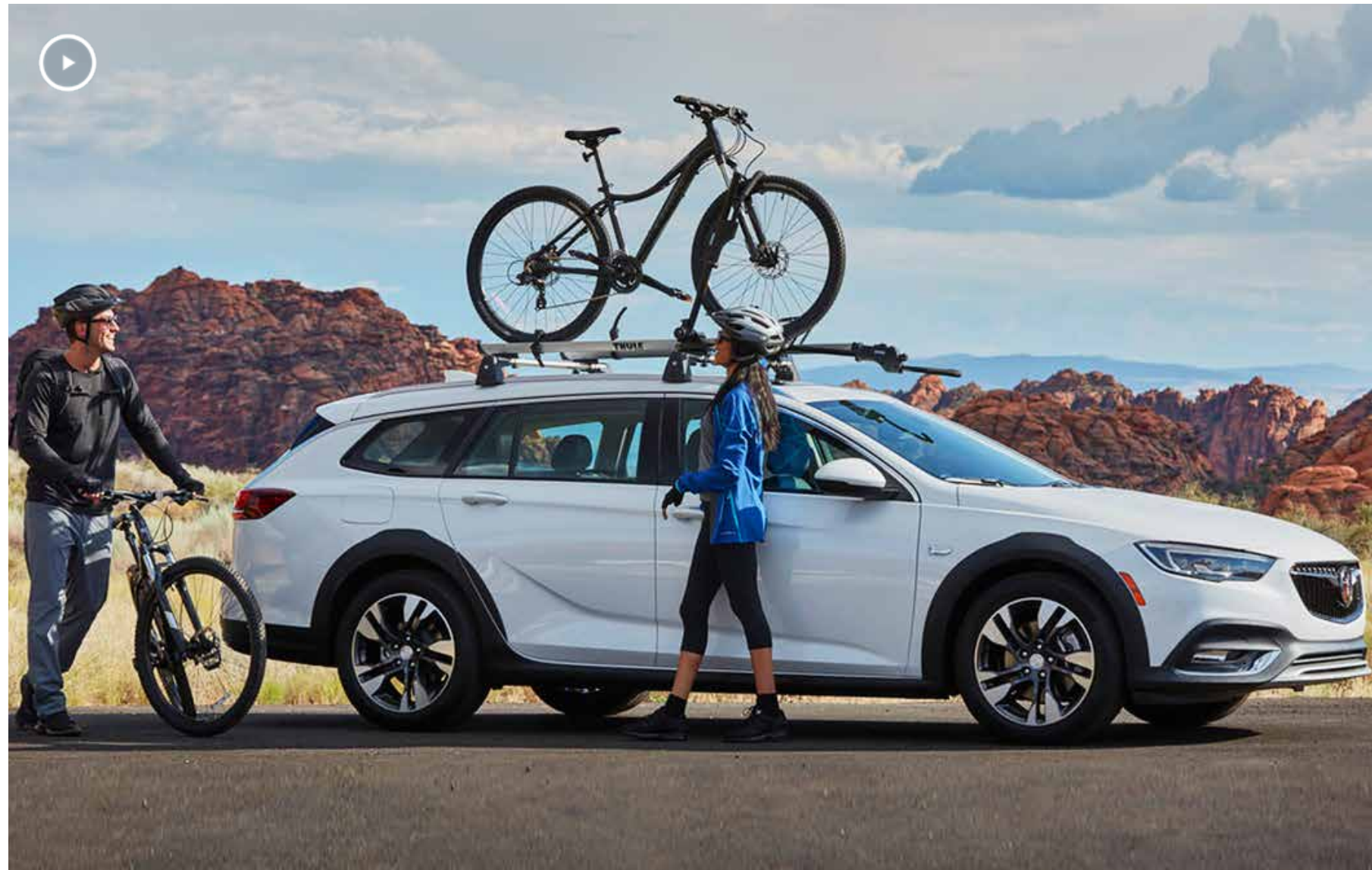
Regal TourX Essence shown in Summit White with available features and accessories including Thule® Side-Arm Bike Carrier.