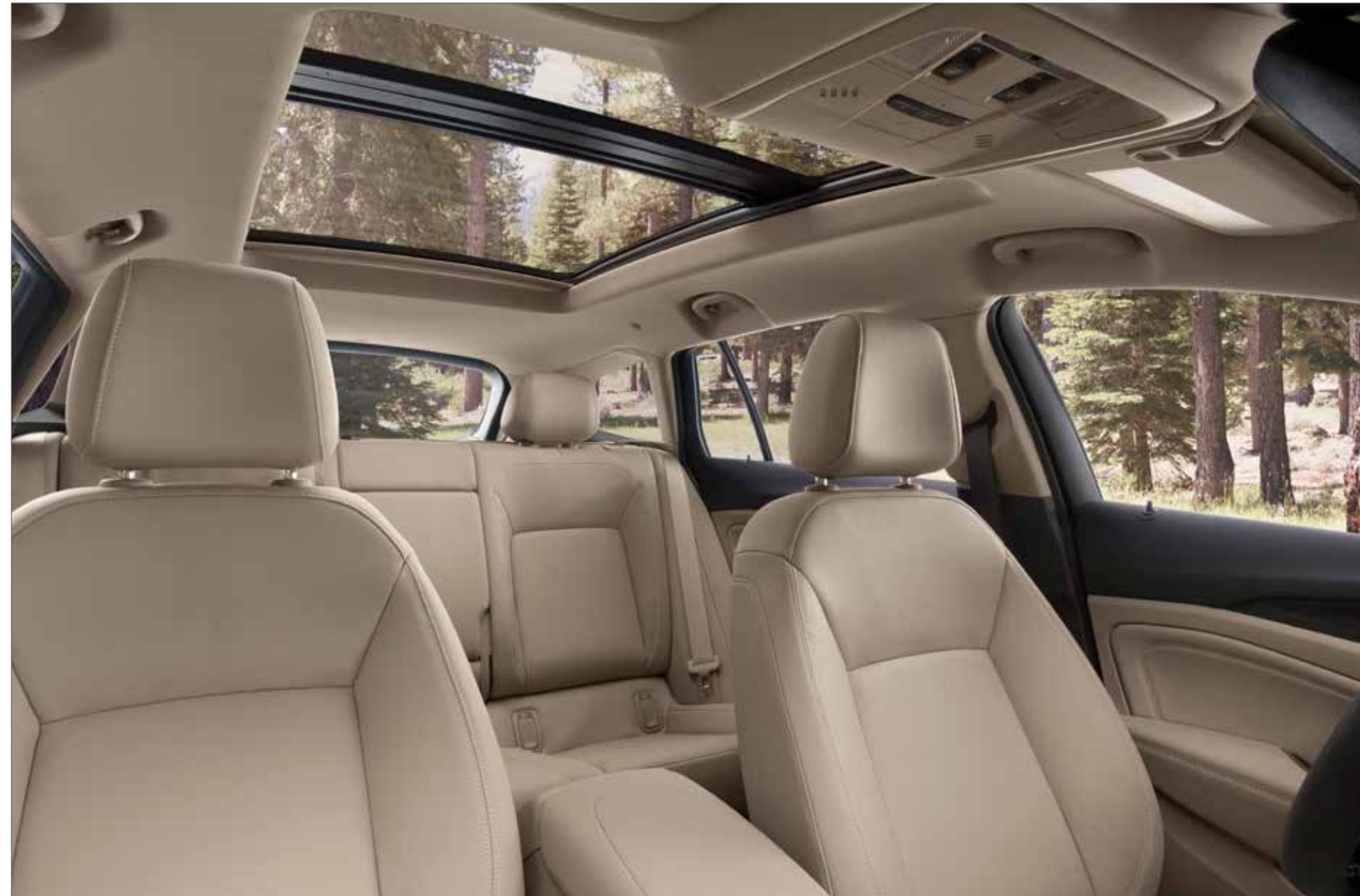
Regal TourX Essence interior shown in Shale with Ebony accents and available features.

DUAL-ZONE CLIMATE CONTROL The standard dual-zone automatic climate control system allows the driver and front passenger to personalize the temperature on their side of the cabin.