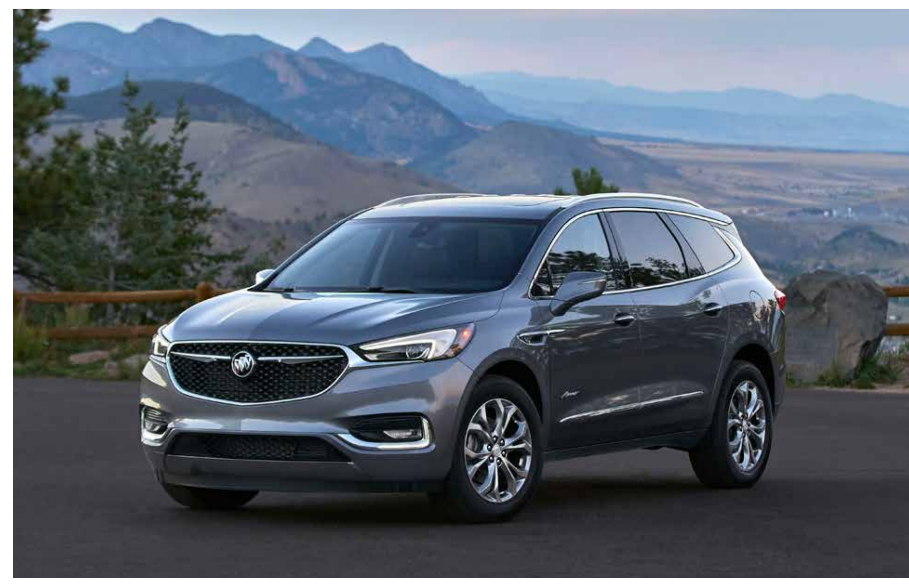
Enclave Avenir shown in Satin Steel Metallic with available features.