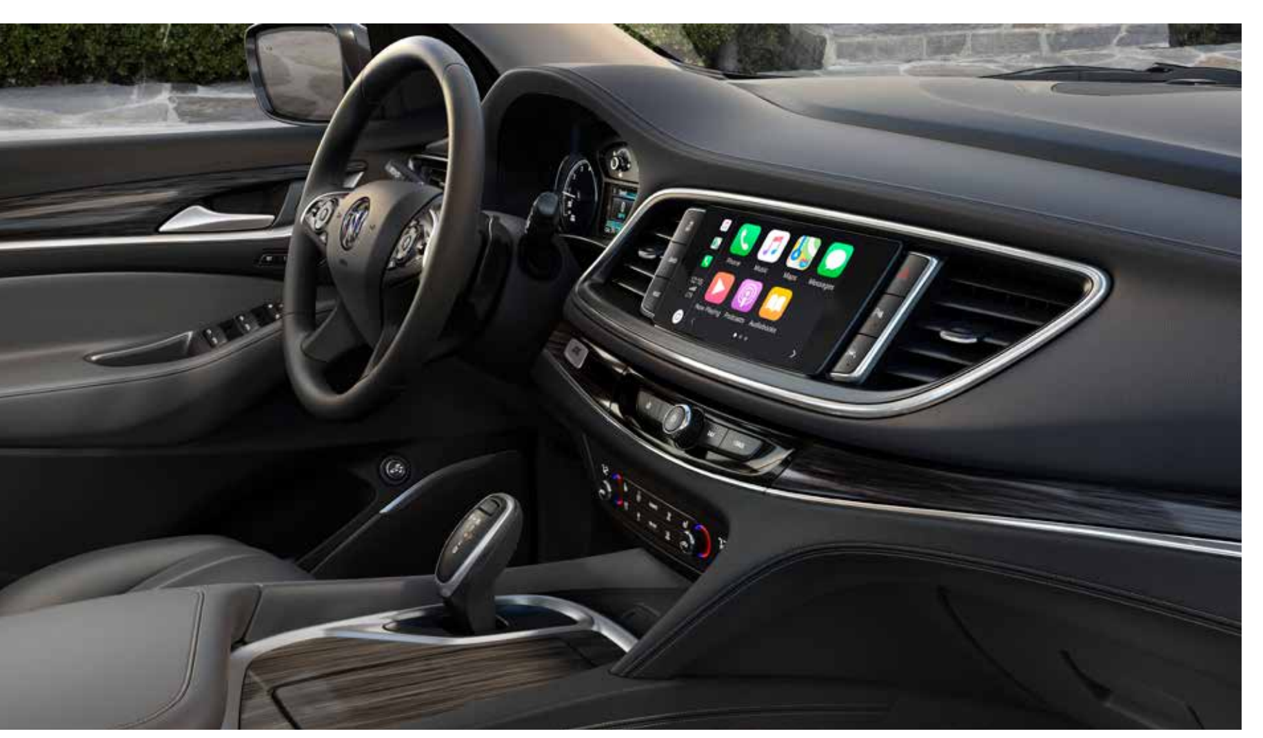
Enclave Premium interior shown in Dark Galvanized with Ebony accents and available features. Apple CarPlay™ shown on infotainment screen.