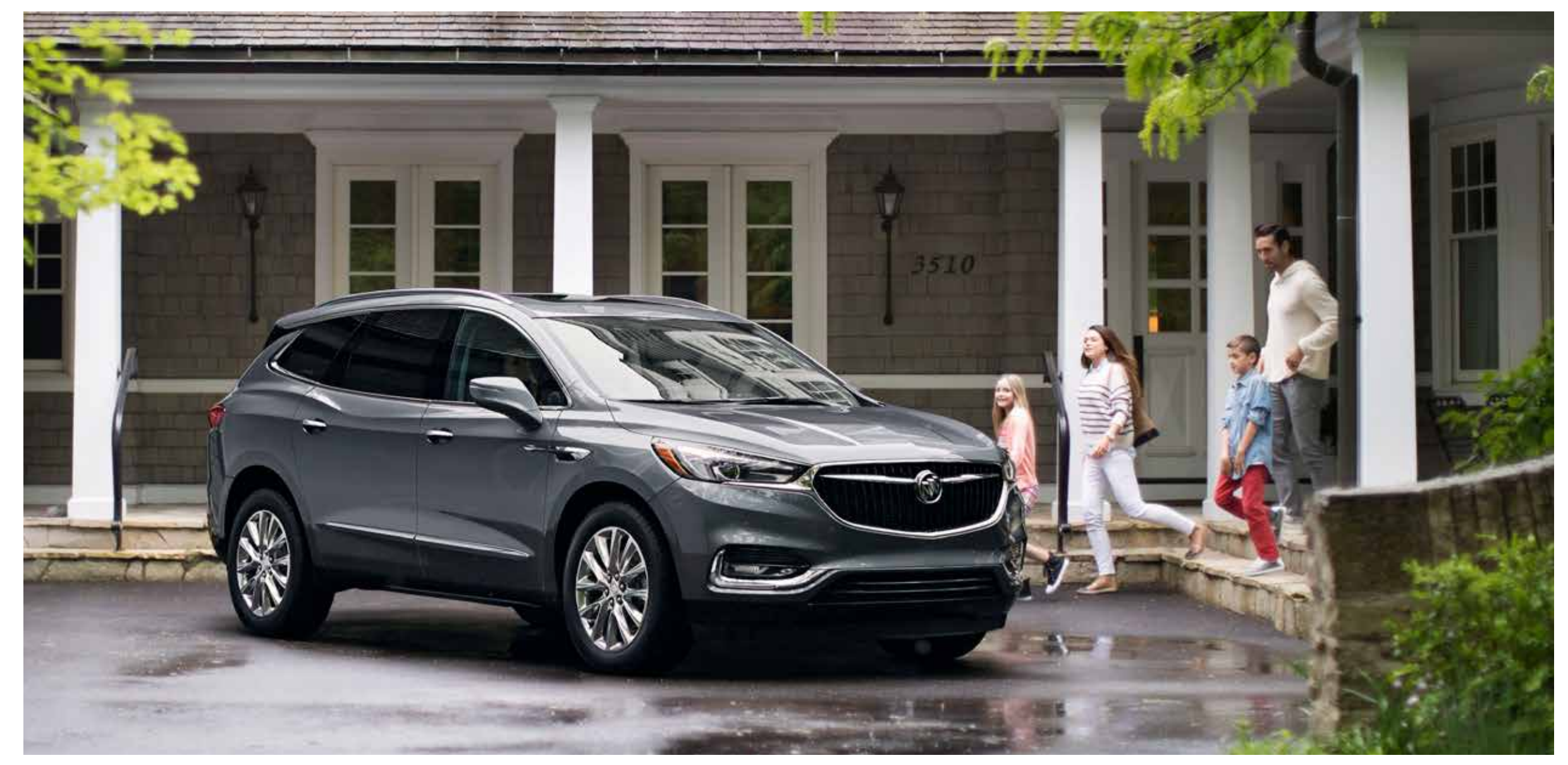
Enclave Premium shown in Satin Steel Metallic with available features.