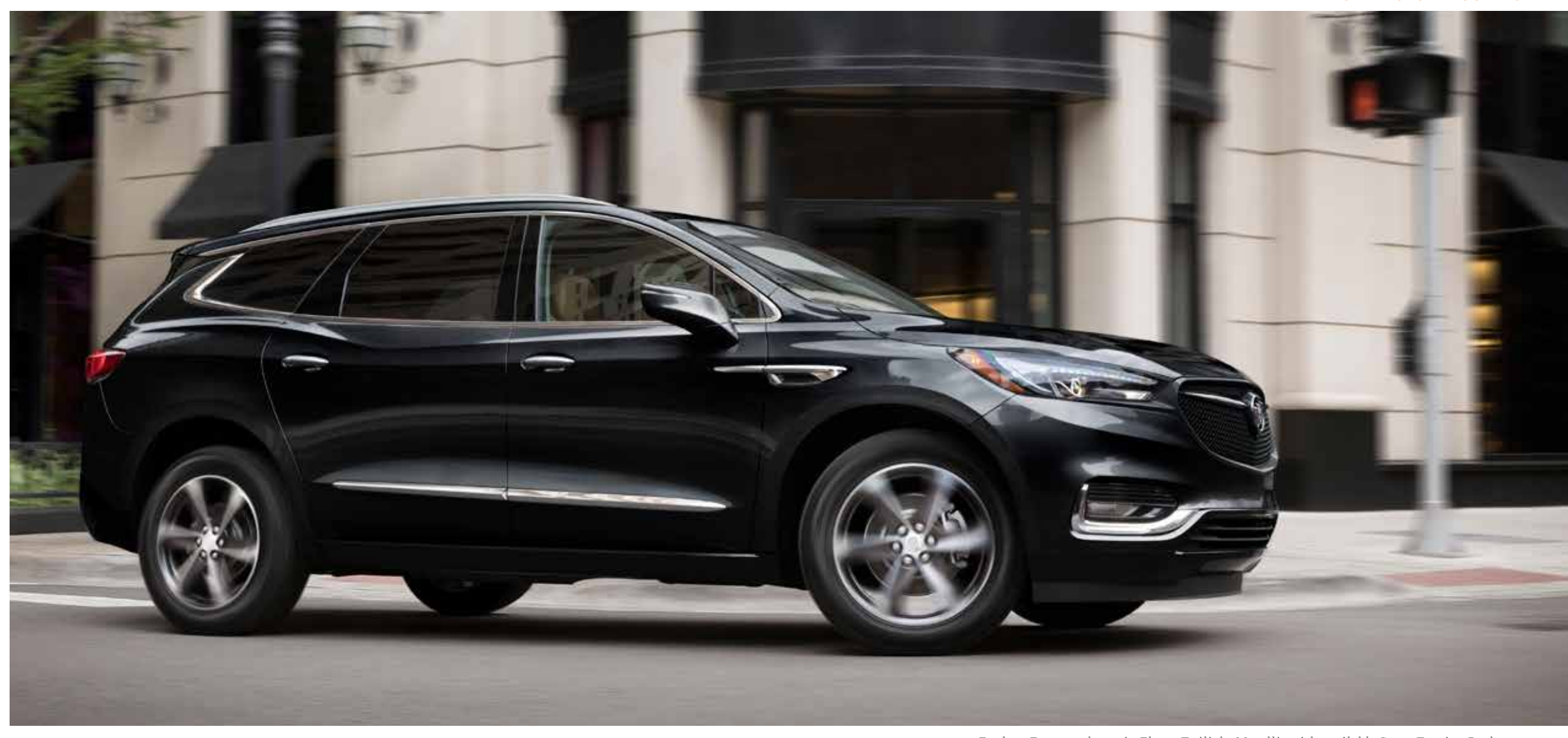
Enclave Essence shown in Ebony Twilight Metallic with available Sport Touring Package.